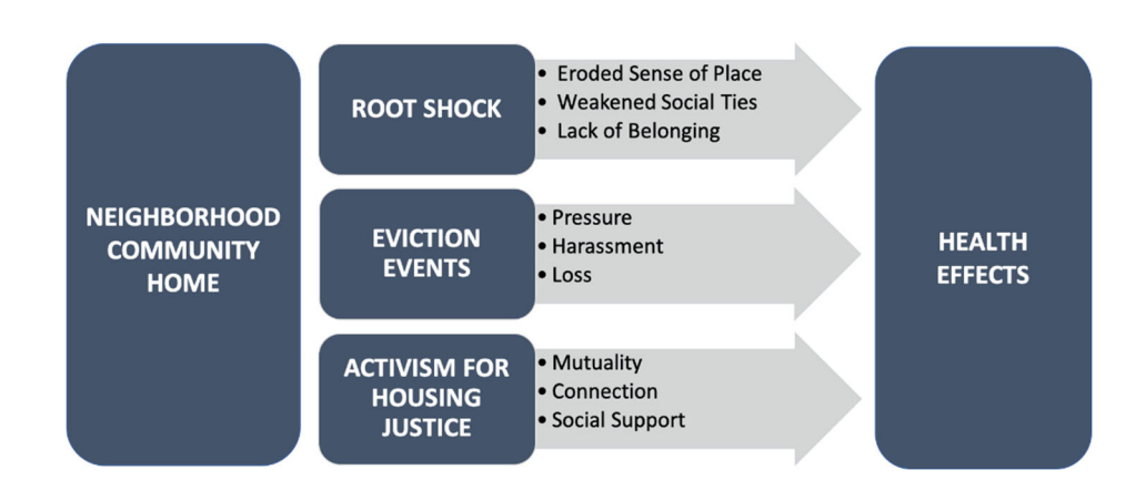
Figure 1: Model of Housing and Health

Sixteen narratives of displacement from the San Francisco Bay Area archive shaped a model of the relationships among housing precarity and health (see Figure 1). At the heart of the model are the three social processes that we found to be most significant as drivers of health and well-being: Root shock, eviction events, and activism for housing justice.